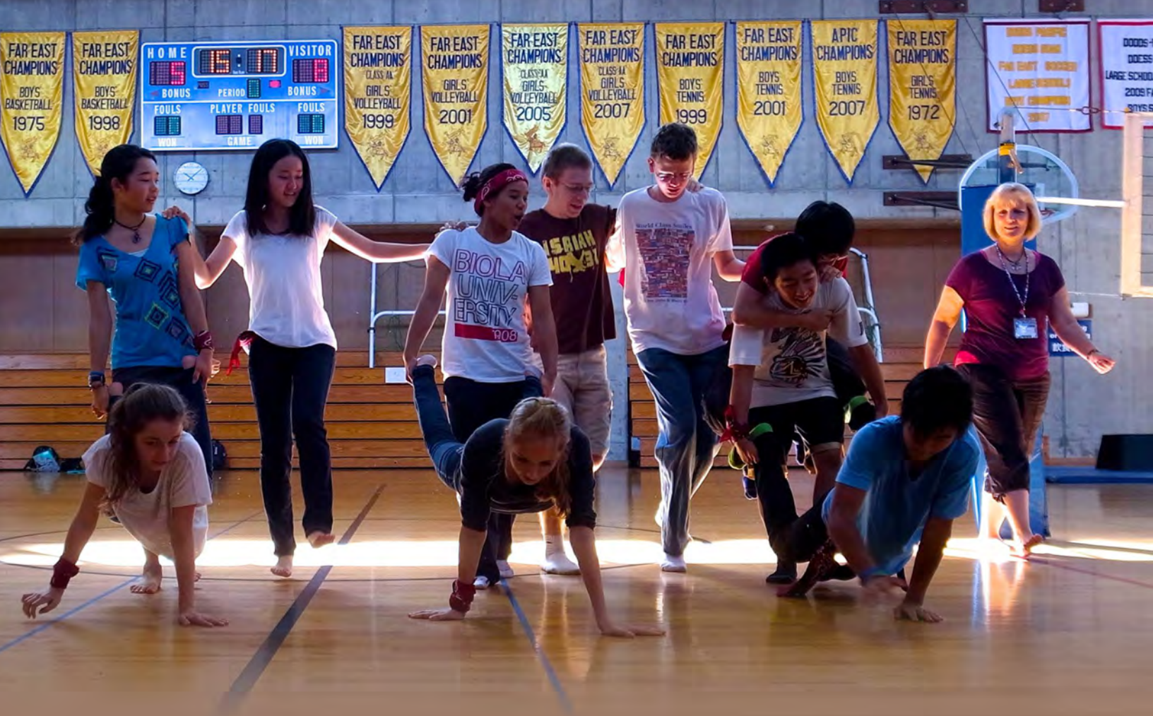
Students from the class of 2016 beginning their week of School-Without-Walls (swow) in the CAJ gymnasium, collaborating with staff on problem-solving physical activities. Swow is a week-long program that is designed to progressively provide opportunities for student leadership development.