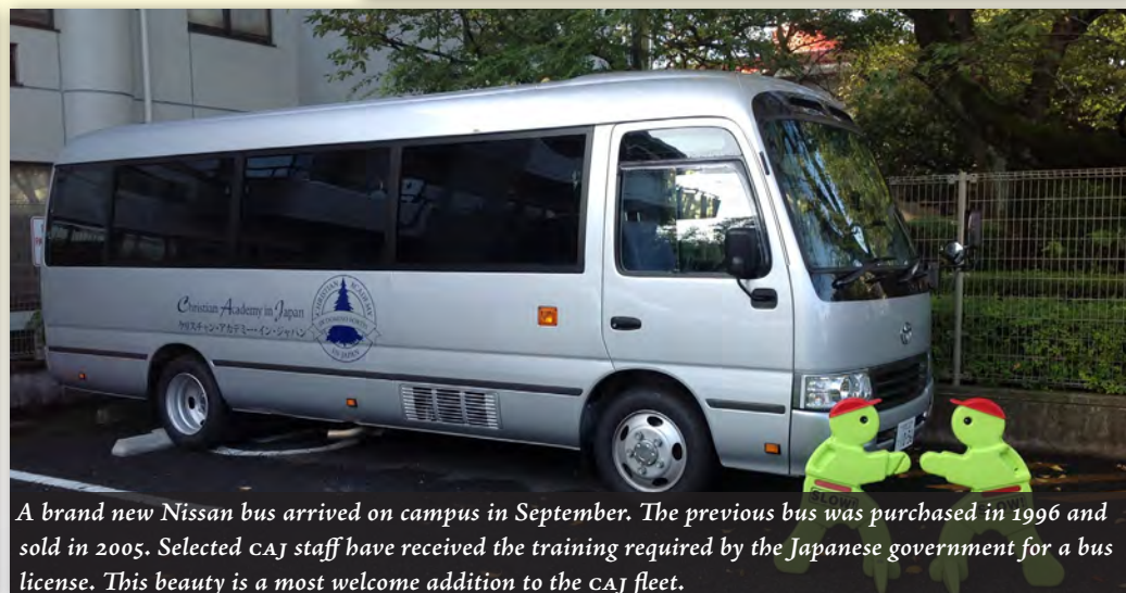
A brand new Nissan bus arrived on campus in September. The previous bus was purchased in 1996 and sold in 2005. Selected CAJ staff have received the training required by the Japanese government for a bus license. This beauty is a most welcome addition to the CAJ fleet.